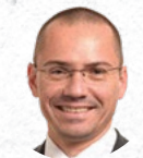
Angel Dzhambazki MEP Bulgaria Vice President