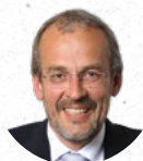
Roberts Zile MEP Latvia Vice President