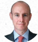
Daniel Hannan MEP United Kingdom Vice President