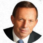
Tony Abbott Former Prime Minister of Australia